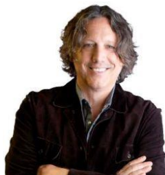
STEVE GORMAN (8p-1a eastern)