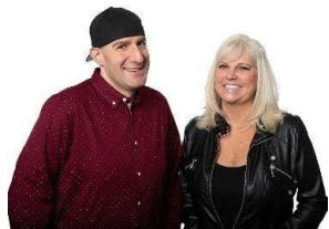
KINCAID & DALLAS (6a-10a eastern)